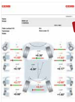
3D Print out