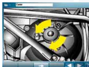
Clear help for adjustment