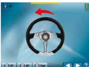
FAST caster swing