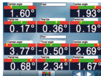
Adjust two axles in one screen